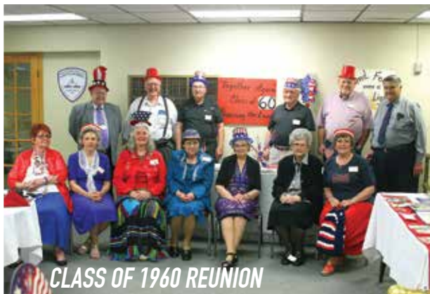
CLASS OF 1960 REUNION