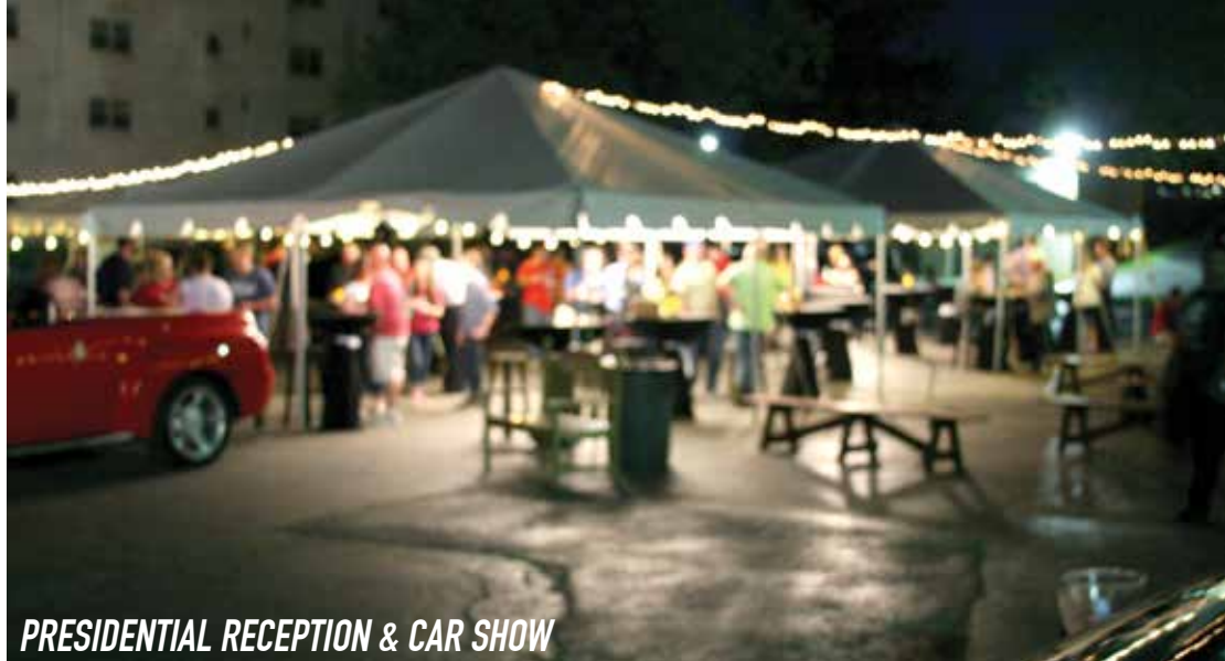
PRESIDENTIAL RECEPTION & CAR SHOW