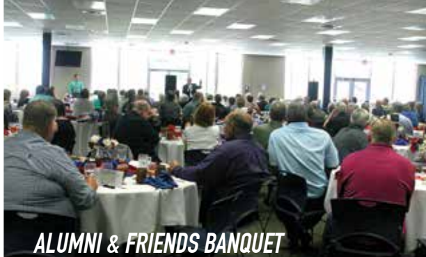
ALUMNI & FRIENDS BANQUET