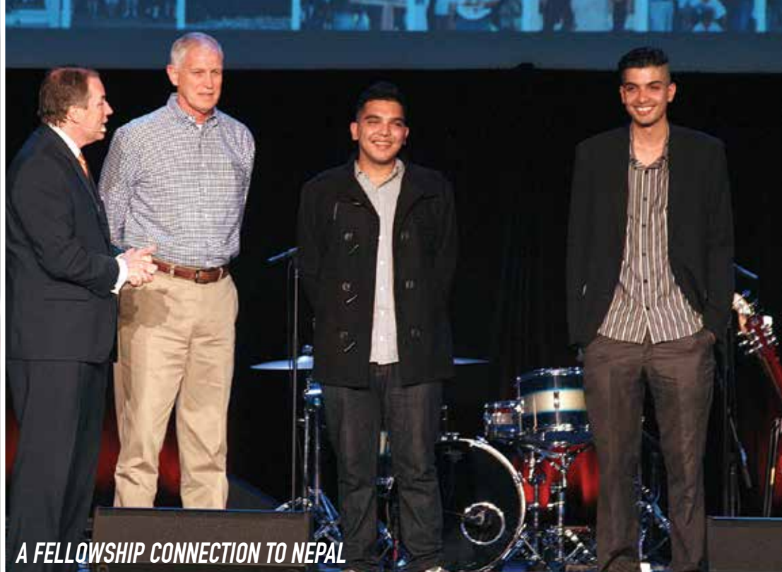
A FELLOWSHIP CONNECTION TO NEPAL